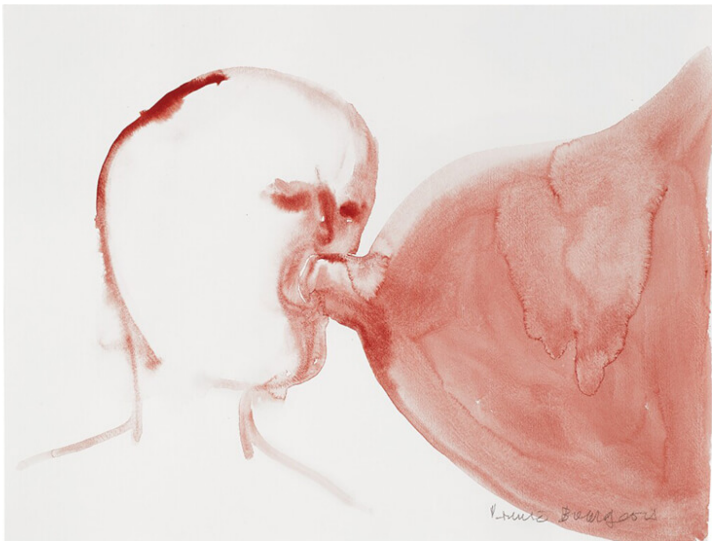
The Feeding, 2007

Just a few years later, in 1938, Bourgeois fled Paris for New York with her new husband, the American art historian Robert Goldwater. She had three sons with Goldwater over a four-year period, while continuing to try and make art. It was undoubtedly a challenge, as Bourgeois later recalled in an interview, “I’m asked all the time, but I never say, it was a lot of work to get through the day. It was really something to have three children and also try to work. It was a lot of physical work.” Anxiety plagued Bourgeois throughout these years, as she struggled to let go of the demons from her own past. She said, “There I was, a wife and mother, and I was afraid of my family...afraid not to measure up.” Bourgeois later spoke of the healing