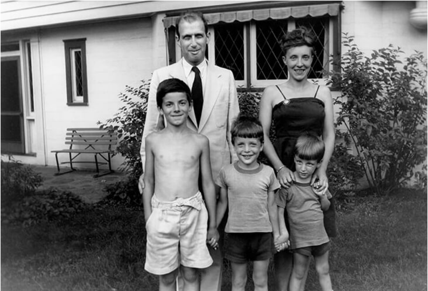
Louise Bourgeois with her husband and their three sons at the Prendergast house in Weston, CT, 1945

impact psychotherapy had on her, allowing her to release the traumas of her past in order to move more sinuously into being a nurturing mother. Art, too, was a healing device that gave Bourgeois room to express, or extinguish her innermost fears and desires.